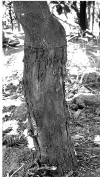
Fig. 2. Bark scaling symptoms on Ovale di Sorrento grafted onto trifoliate orange rootstock.

Biological indexing. Out of the 112 citrus field sources graft-inoculated into Etrog citron plants, 104 (93%) induced viroid-like symptoms. The times required for symptom development differed. The average for initial symptom appearance was about 4 weeks. Symptoms