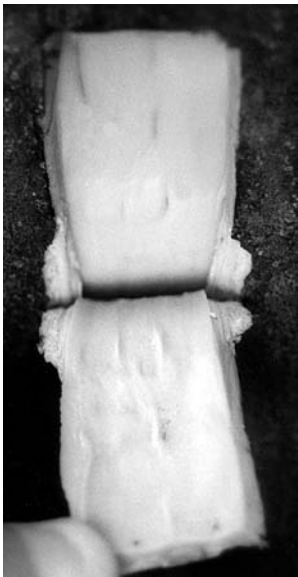
Fig. 1. Wood pitting on a clementine tree affected by cachexia.

Field surveys. Field inspections carried out in Campania over a three-year period showed the presence of cachexia-like symptoms in 37 out of 38 sampled mandarin and clementine trees (Fig. 1). Severe bark scaling characteristic of exocortis was observed on a single 'Ovale di Sorrento' lemon, the only sampled tree found to be grafted onto trifoliate orange (Fig. 2).