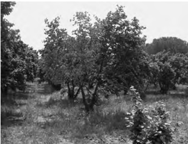
Fig. 1. Typical dieback ( moria ) symptoms in a hazelnut plant of cv Tonda Gentile Romana.

Field experiments were done over four years (1999-2002) in two different hazelnut areas in the province of Viterbo; one in the Soriano nel Cimino area (1999 and 2000) and the other in the Caprarola area (2001 and 2002). Both sites were characterized by typical moria